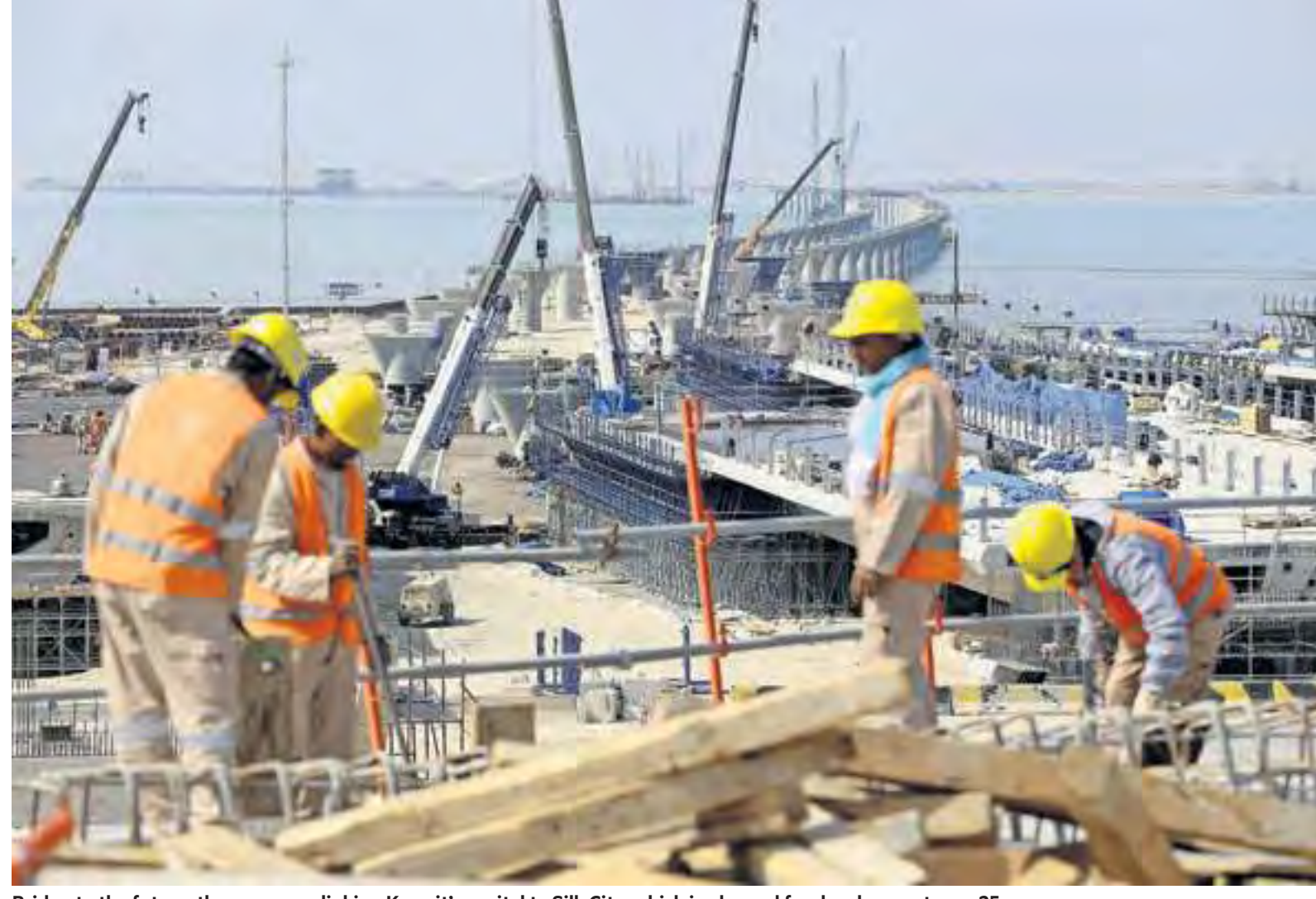
Bridge to the future: the causeway linking Kuwait's capital to Silk City, which is planned for development over 25 years

The government announced last October that it had allocated 700 more plots of land in two industrial zones in Shadadiya and Salmi with the aim of creating 2,000 jobs and attracting $2.7bn in investment. Describing them as "the largest in Kuwait's history", minister of commerce and industry Khalid al-Rodhan said the allocations, compared with the release of just 270 plots over the past 15 years, would help increase competition in the country and encourage new investors in the